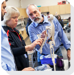
Privately Hosted Face-to-Face & Virtual