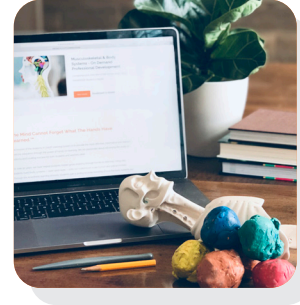
Anatomy On Demand™ Self-Guided Courses