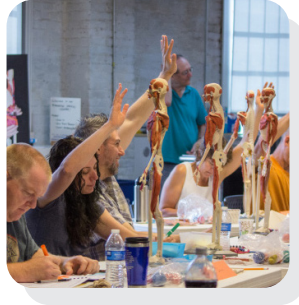
Live & In Person Face-to-Face Courses