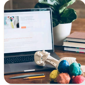
Anatomy On Demand™ Self-Guided Courses