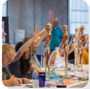
Live & In Person Face-to-Face Courses