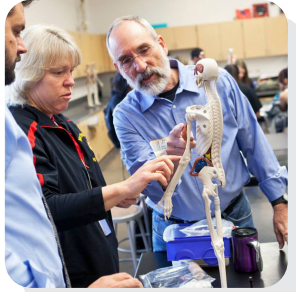
Privately Hosted Face-to-Face & Virtual